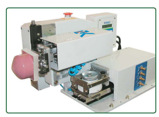
90° swiveling pad movement